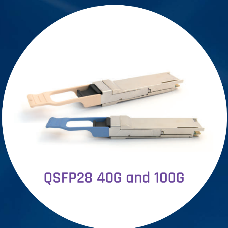
QSFP28 40G and 100G