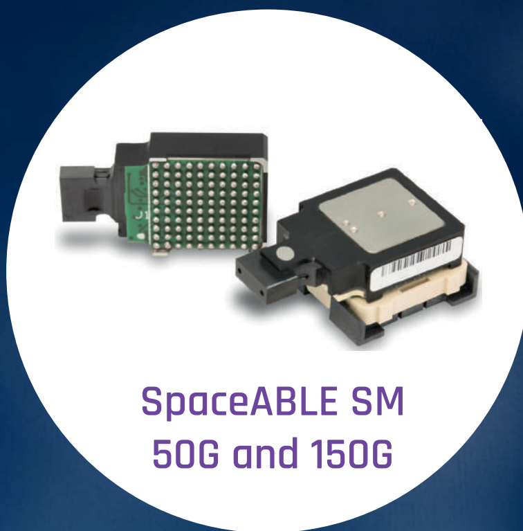
Radiation-resistant optical transceivers